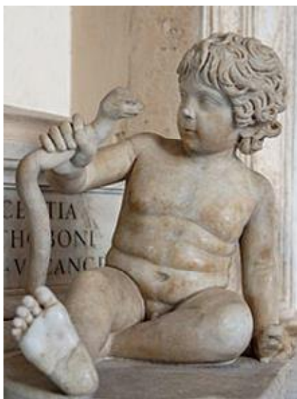
The statue of Hercules and two snakes located at the museum of Capitolini in Rome, Italy